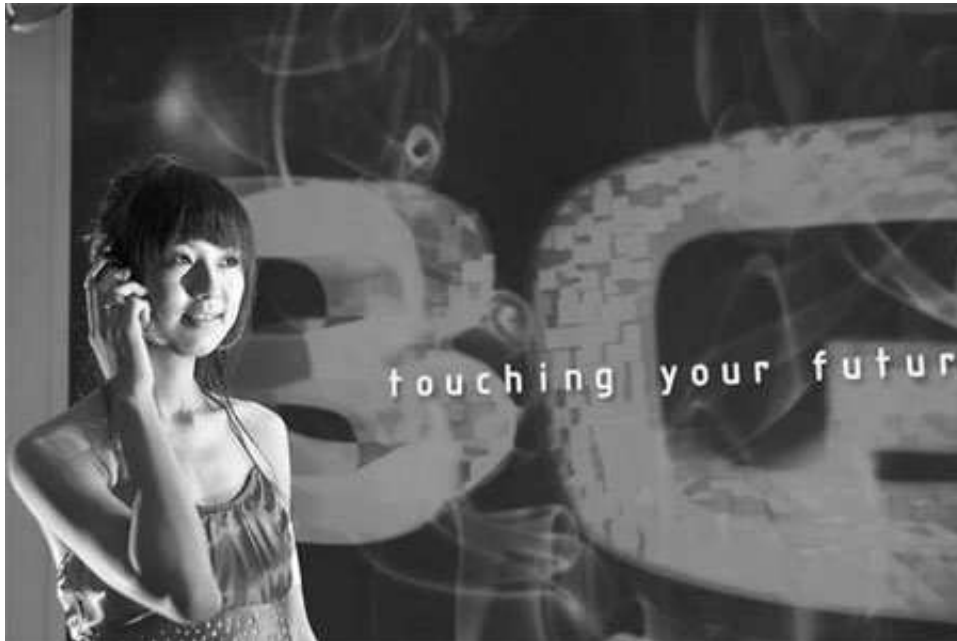
A lady makes a demo 3G phone call at a telecom show in Beijing.

China Wednesday officially awarded the long-awaited licenses for third generation (3G) mobile networks to three telephone operators, paving the way for investments of around 280 billion yuan in network upgradation and expansion over the next two years.